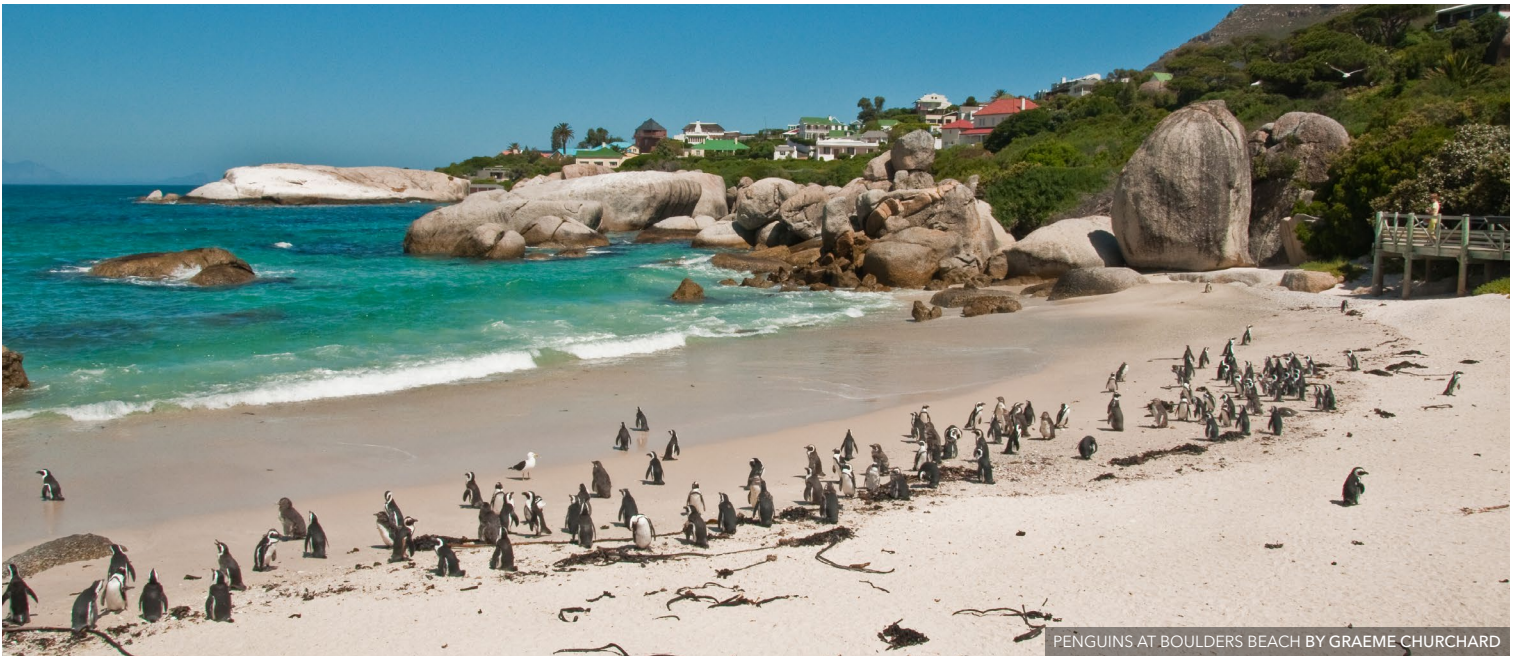
PENGUINS AT BOULDERS BEACH