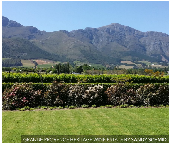
GRANDE PROVENCE HERITAGE WINE ESTATE BY SANDY SCHMIDT

This morning you will be transferred to the Johannesburg International Airport for your flight to Hoedspruit (cost of flight