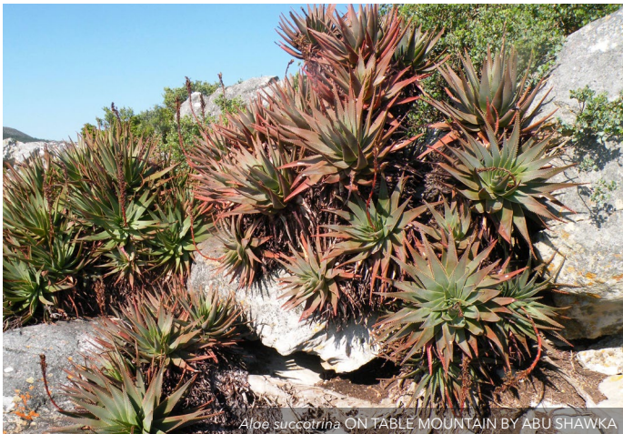
Aloe succotrina ON TABLE MOUNTAIN BY ABU SHAWKA

Upon arrival at the Johannesburg International Airport, after clearing customs and collecting your luggage, you will be met and escorted to the Inter-Continental OR Tambo Hotel. This evening gather together with your fellow travelers for a Welcome dinner at the hotel. Overnight at Inter-Continental OR Tambo Hotel (D)